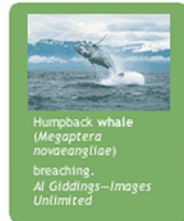
Humpback whale ( Megaptera novaeangliae ) breaching.

but lives beneath the sea. The blue whale is Earth's largest animal. Larger than the largest of ancient dinosaurs, blue whales can grow to be more than 100 feet (30 meters) long and weigh nearly 150 tons. Not all whales are so large.